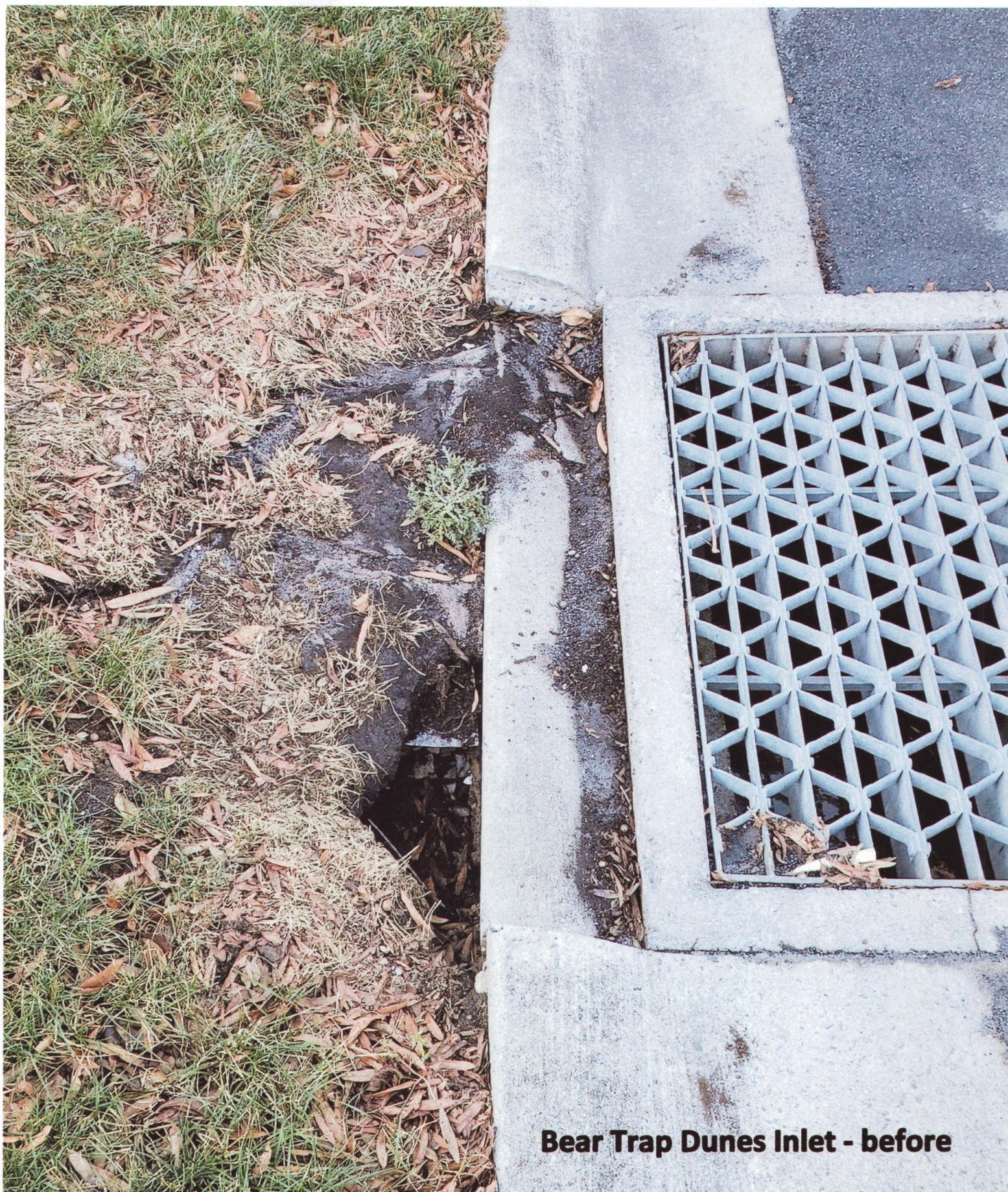
Bear Trap Dunes Inlet - before