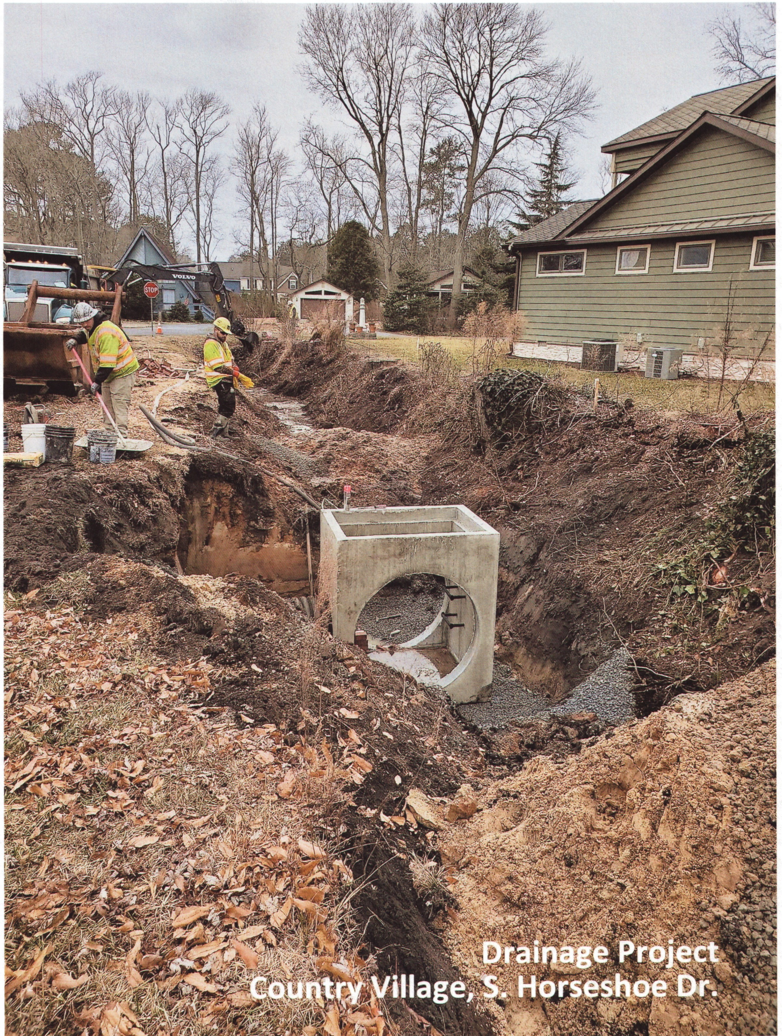
Drainage Project Country Village, S. Horseshoe Dr.