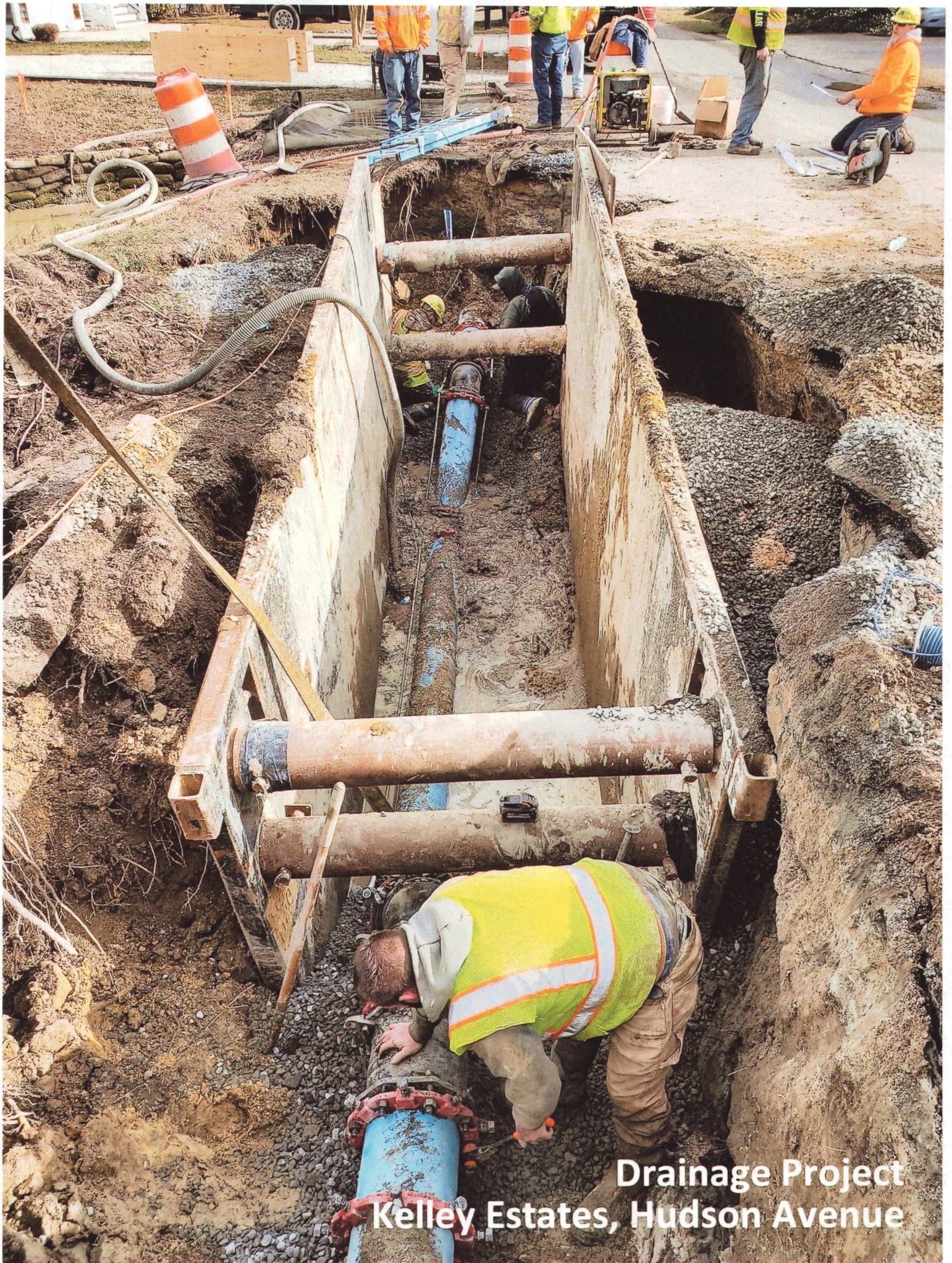
Drainage Project Kelley Estates, Hudson Avenue